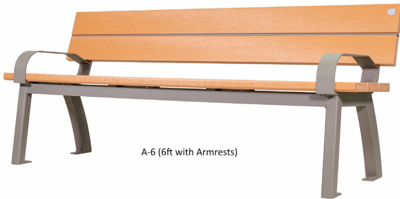
A-6 (6ft with Armrests)

ANA-6 (6 ft without armrests) ANA-5 (5 ft without armrests) A-6 (6 ft with armrests) A-5 (5 ft with armrests)